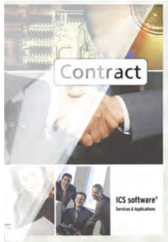
Matt finish at the front and clear finish at the back