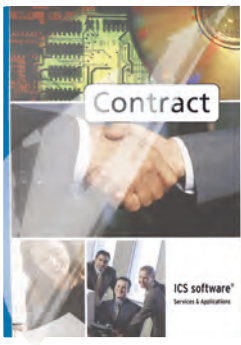
Clear finish at the front and matt finish at the back